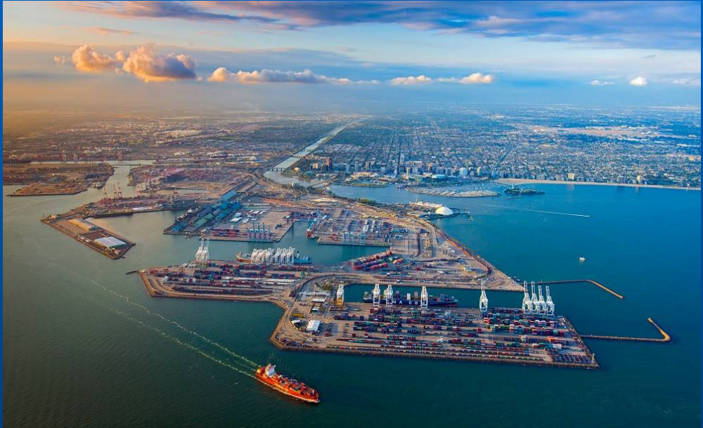
Port of Long Beach