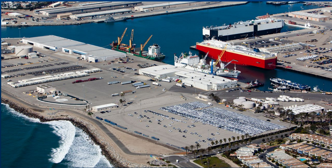
Port Hueneme, Oxnard, CA