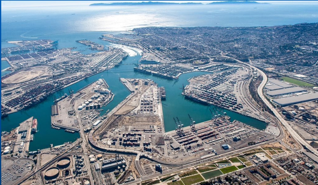
Port of Los Angeles