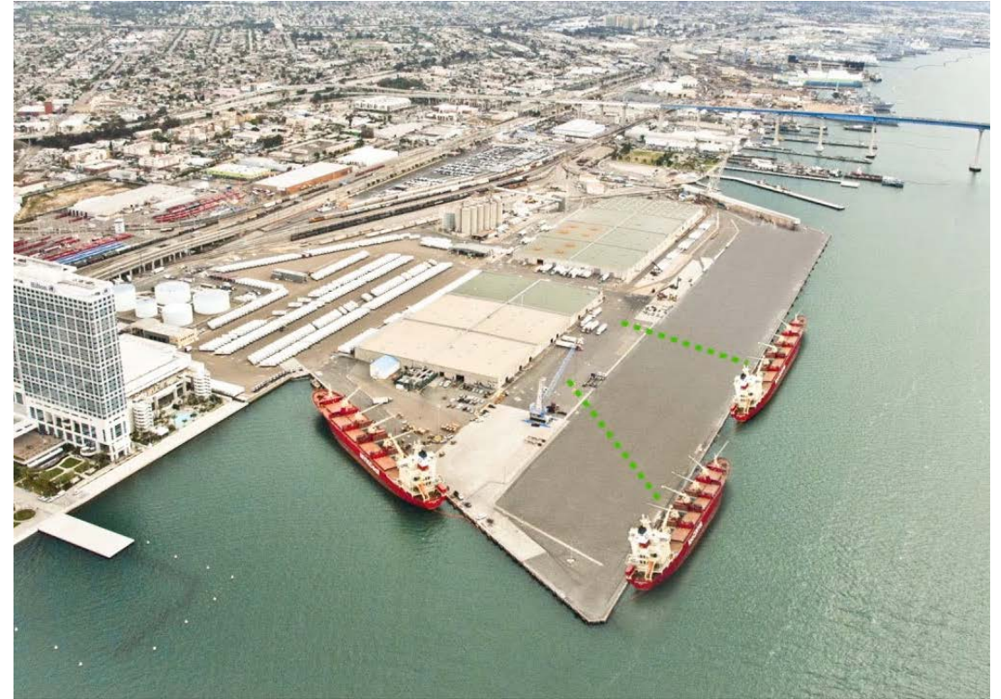
Projected outlook after demolition of transit shed 2 in August 2020