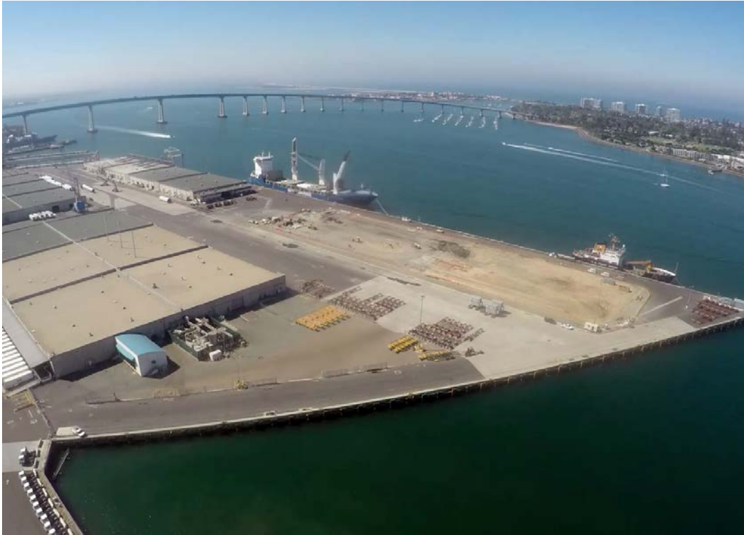
March 2019- Demolition of Transit Shed 1